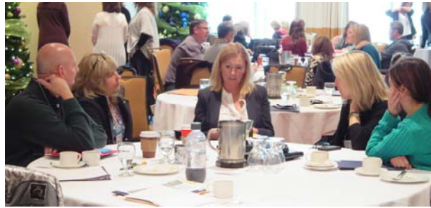
District Partner Meeting Richmond, B.C. November, 2015