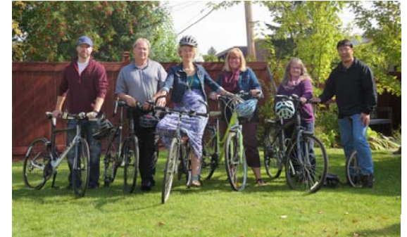
Have Team Will Travel

Through our website, presentations, online training and District Partners, we share best practices and research in order to support educators and increase their capacity to meet the learning needs of students with FASD.