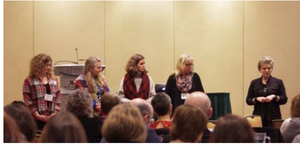
District Partner Meeting Richmond, B.C. November, 2017